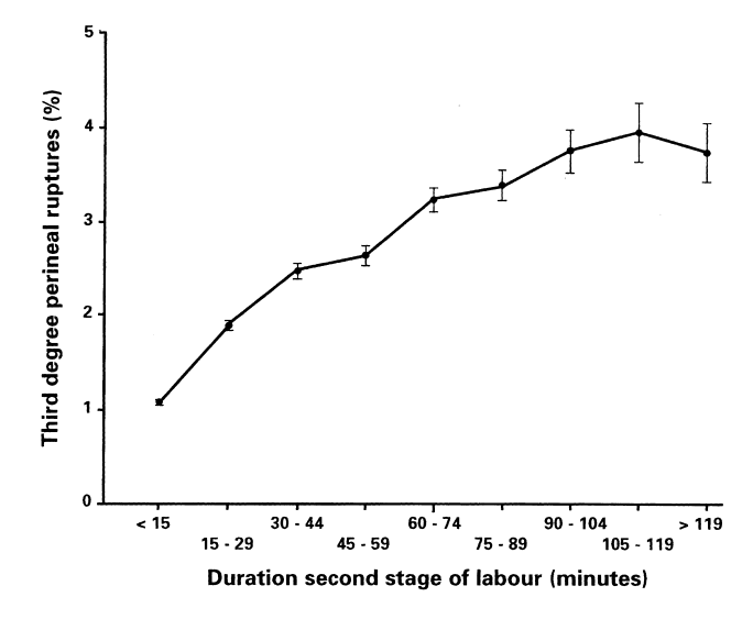
Fig. 2. Risk of third degree perineal ruptures per 15 minutes duration of second stage of labour.

The overall risk of third degree ruptures of the perineum in our study, defined as any rupture of the perineum involving anal sphincter muscle, is 1.94%. This incidence is higher than that in some European reports<sup>2,5,13,15</sup>, comparable to that in other studies from the continent 6,14, but much lower than the incidence reported from the United States 11,12,16,17.